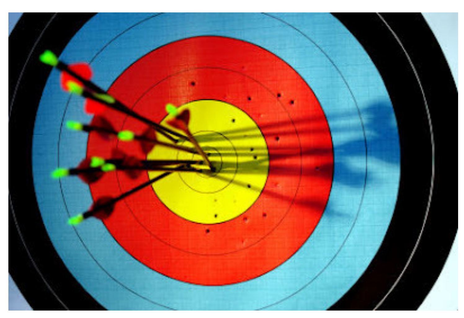
AN EQUITABLE RESULT FROM AN EQUITABLE PROCESS